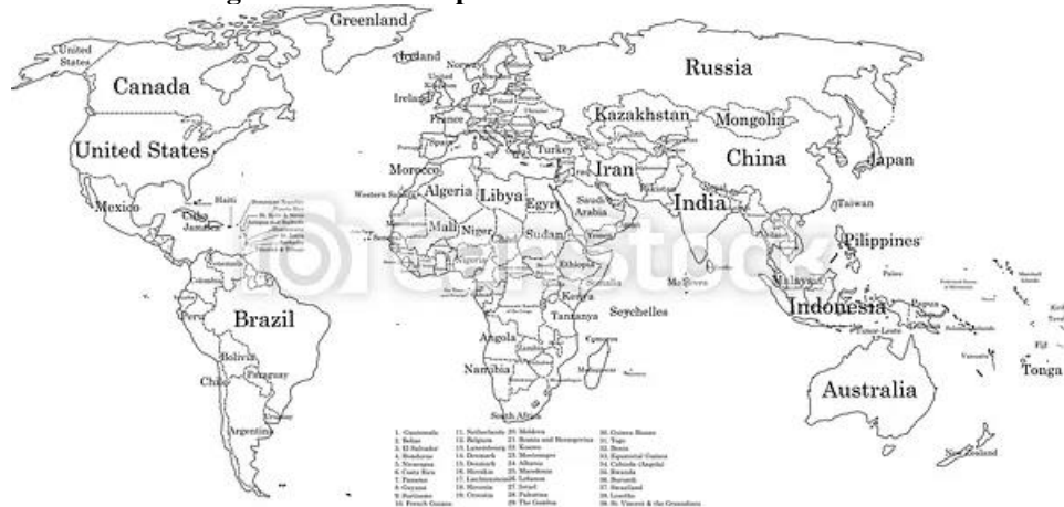
Figure 1: World Map - Brazil on the Terrestrial Globe

The literature review was carried out by the number of citations in Google Scholar, selecting those with more than five citations in journals, having as theoretical criteria those that dealt with beef exports and cited Brazil as one of the eligibility criteria, as well as how to use international trade measurement methods, based on the use of foreign trade indicators.